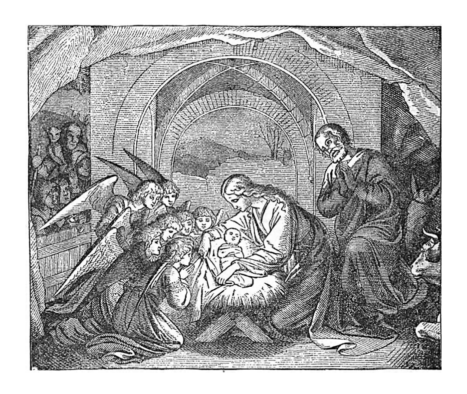
THE FEAST OF THE NATIVITY CHRISTMAS EVE DECEMBER 24, 2024