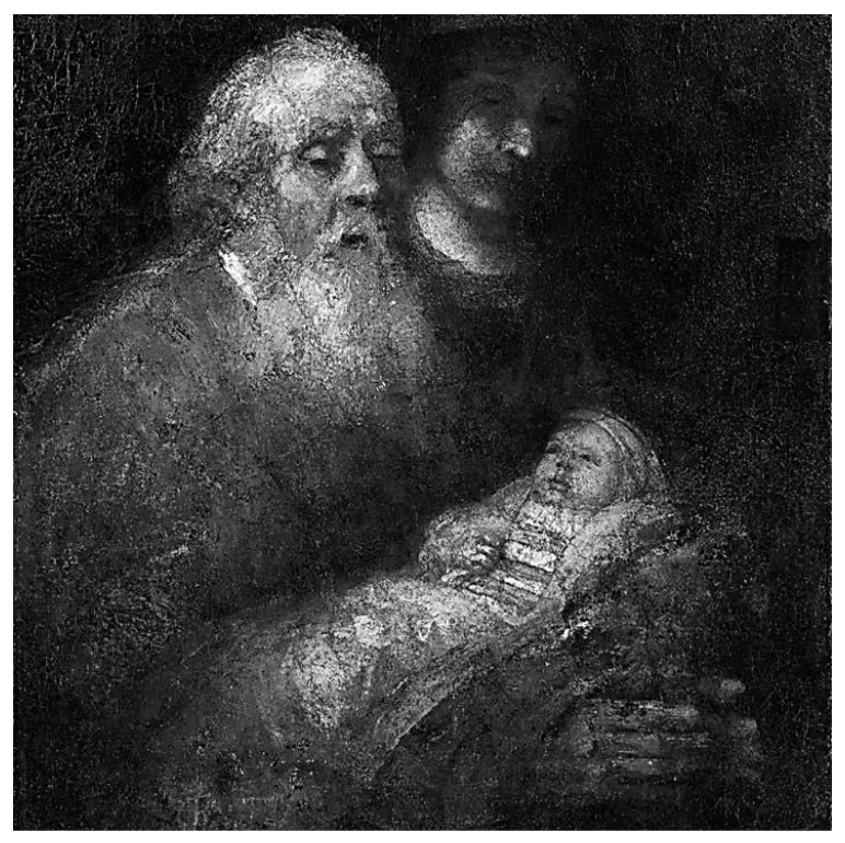
THE PRESENTATION OF OUR LORD THE FOURTH SUNDAY AFTER THE EPIPHANY FEBRUARY 2, 2025